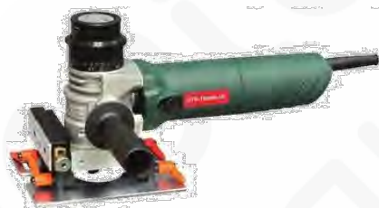
WELD BEAD (EXTERNAL) SHAVING FOR PIPE – LENGTH DIRECTION