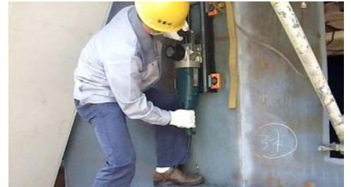
« Removing weld bead and stiffener on floor

Robust, durable & cost effective counter sinks for quick chamfering with hand tools or drill press