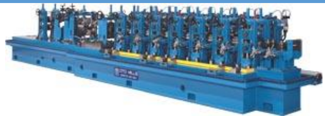
Oto 503 Tube Mill