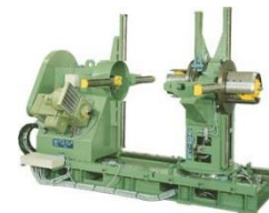
Oto AD 256 Decoiler

We also offer solutions for machine installation, technical upgrades, and spare parts.