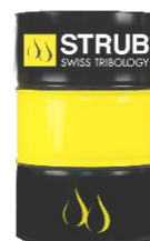
Coolant/ Hydraulic Oils