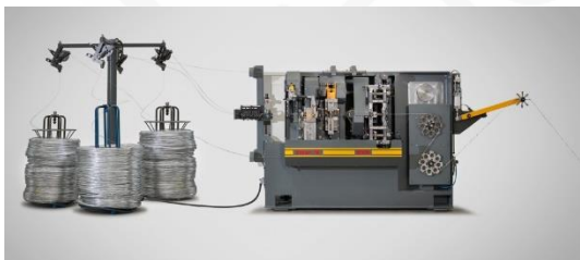
Barbed Wire Machinery