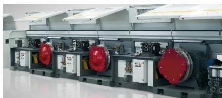
Cold Rolling Lines

We offer a full range of high-performance machines for the production and handling of reinforcement wire, including cold rolling lines, stretching lines, fully automatic spoolers, payoff and complete lattice girder lines.