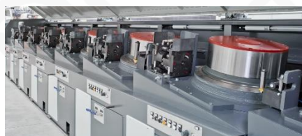
Multipass Drawing Lines

We produce complete lines for processing either Low Carbon or High Carbon and Special Alloyed wires, providing up-to-date technology and maximum attention at the customer's service.