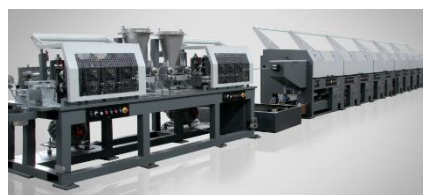
Flux-Cored Wire Production Lines