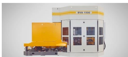
Spoolers & Coilers