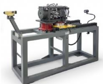
WIRE CASSETTES ACCESSORIES

Sensorized wire cassette, with remote control access of production processes, parameter controls and maintenance.