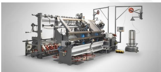
Chainlink Fencing Machinery