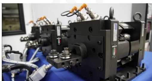
SMART CASSETTE 4.0

This model mounts 3+3 rolls and roll holders and is always supplied fully assembled.