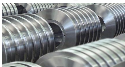
Straightening Rolls and Cylinders