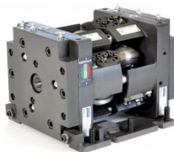
INDUSTRIAL WIRE MICROCASSETTES TYPE C

Cassettes to produce wires for lattice girders, wire mesh and reinforced concrete applications.