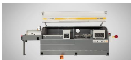
Welding Electrodes Production Lines