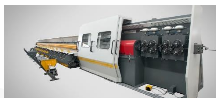
Rebar Production Lines