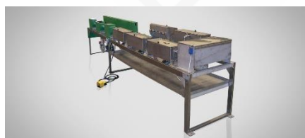
In-Line Cleaning Units