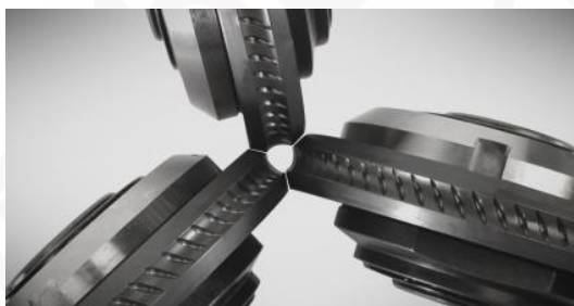
Tungsten Carbide Wire Rolls

Brand new surface coatings have also been developed by Eurolls with the collaboration of local universities and customers, to increase roll life and to improve the quality of the final product.