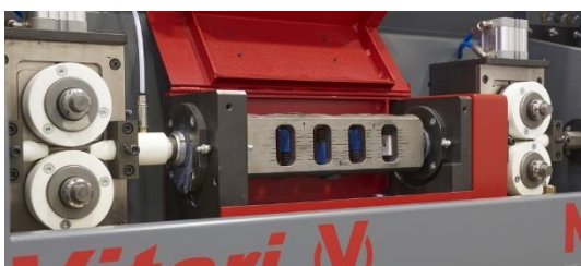
Straightening And Cutting Machines

For those of you looking for historically trustworthy and sturdy machines, but need something with the latest technology, you can count on Eurolls. The Vitari brand machines combine robustness, reliability, technological innovation and outstanding performance.