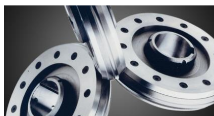
Rolls for Hot Applications