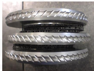
Tungsten Carbide Rolls